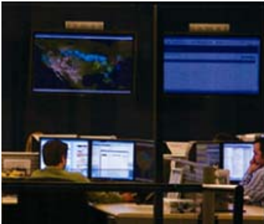
Dispatchers use FlightView to track flights in the air in real-time.

CitationShares takes pride in their client service excellence going beyond the in-air experience including airport drop-off and pick-up. On the ground experiences supported by FlightView include ground transportation companies, FBOs and individual service providers.