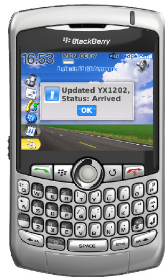
Push notifications to your mobile app users